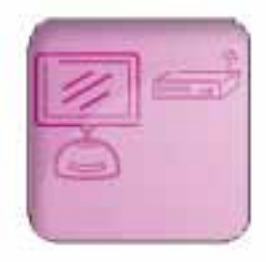
24/7 Wireless Internet and quiet work stations