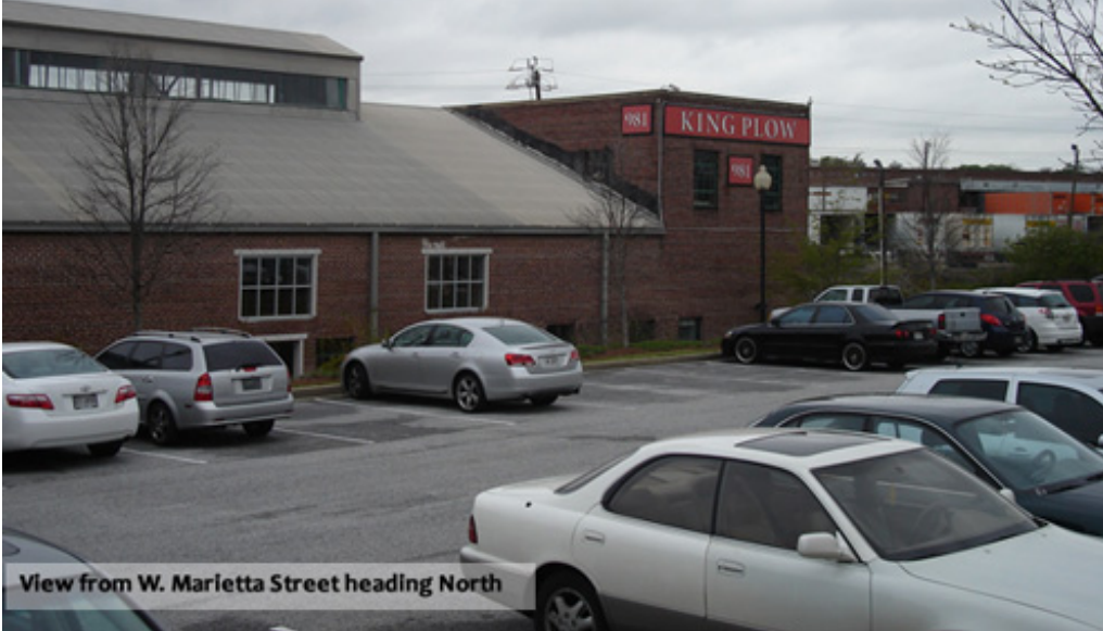
View from W. Marietta Street heading North

Roundbox Global 981 Joseph E Lowery Blvd Suite 100 Atlanta, GA 30318