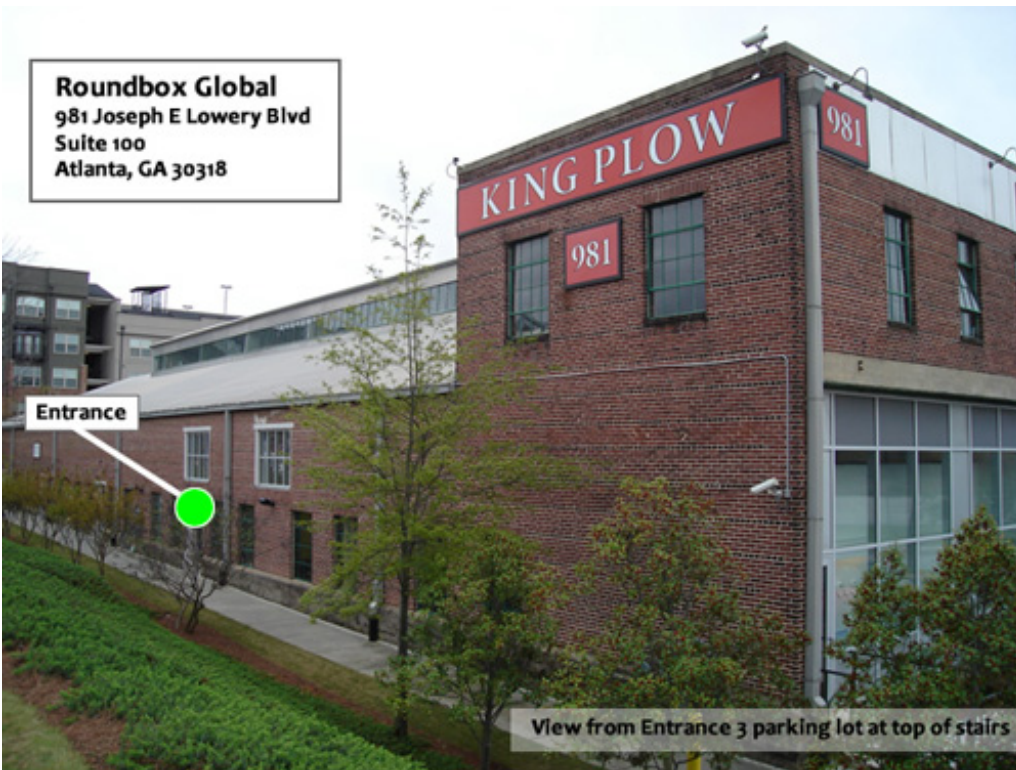
View from Entrance 3 parking lot at top of stairs

Roundbox Global 981 Joseph E Lowery Blvd Suite 100 Atlanta, GA 30318