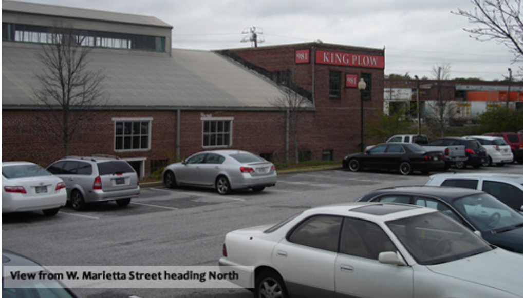
View from W. Marietta Street heading North

Roundbox Global 981 Joseph E Lowery Blvd Suite 100 Atlanta, GA 30318