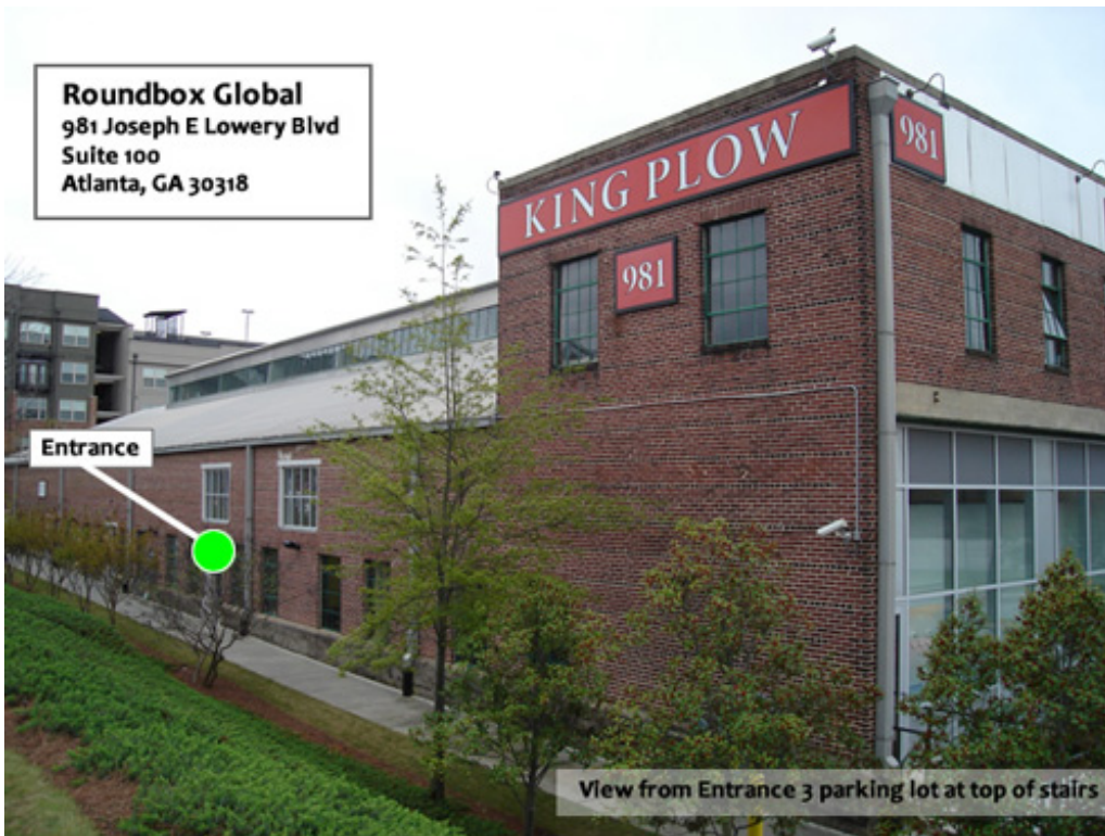
View from Entrance 3 parking lot at top of stairs

Roundbox Global 981 Joseph E Lowery Blvd Suite 100 Atlanta, GA 30318